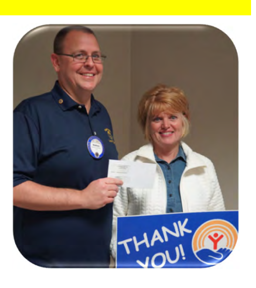
United Way $2500