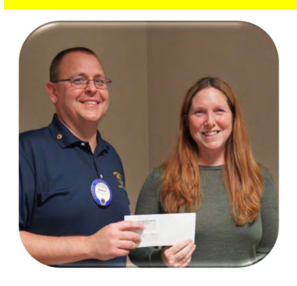
Loving Hearts $1000