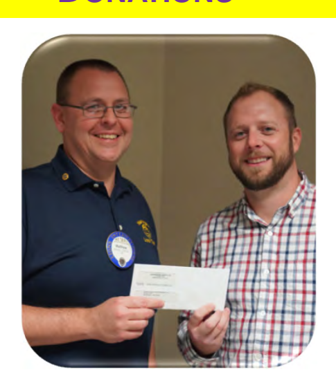
Downtown Washington, Inc. Rennick Riverfront playground - $10,000