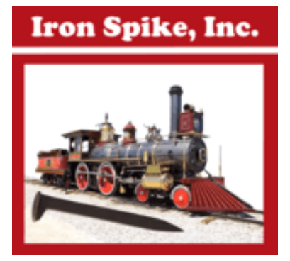
Don Burhans and Claire Saucier of Iron Spike Model Train Museum were guest speakers on January 15th.