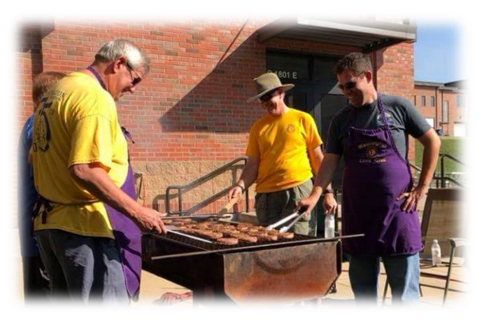
Washington Lions Club members grilling for the Special Olympics