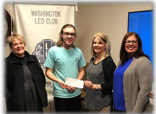
LEO's at their March meeting and presenting a donation check to Angel of Hope