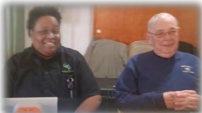
Pictured: First time Eye Screening at Harvest Table.